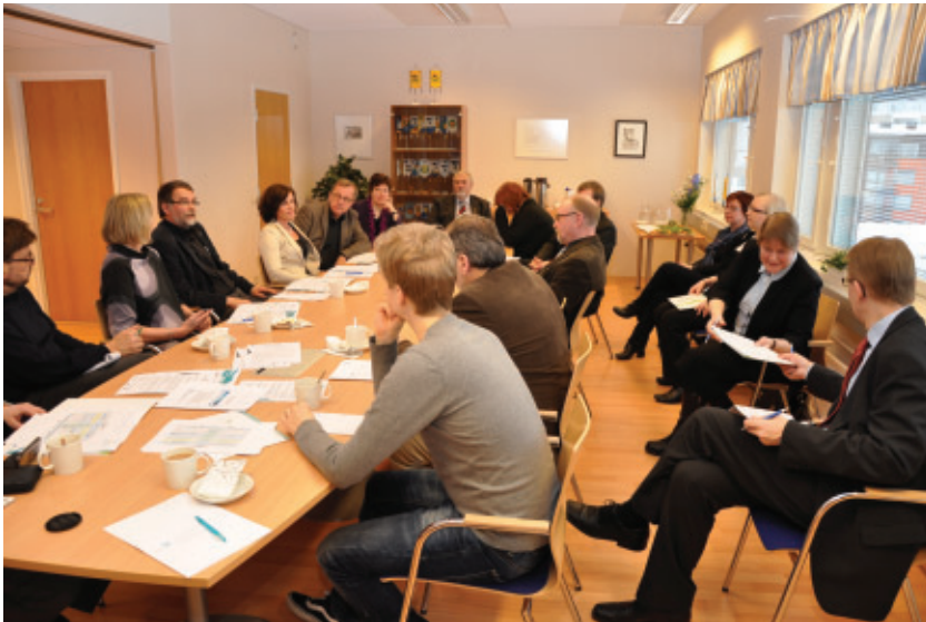
Local politicians and stakeholders discussing about Mood for Work in a project representation

tate discussion of values, aims, welfare and environment.